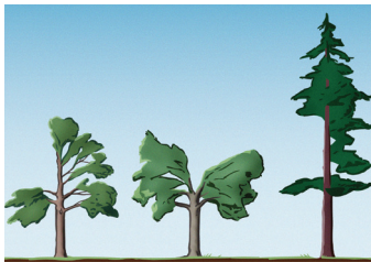
Shapes you can expect from properly pruned trees.

Tree pruning can have a profound effect on the appearance of trees. After pruning, trees are usually asymmetrical.